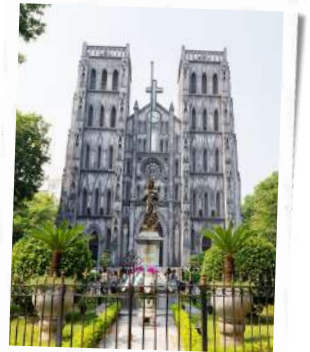
St. Joseph's Cathedral

Sunday: 6:30 ; 8:30 (children); 10:30 (English); and 19:00